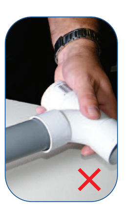
✓ Ensure you purchase the correct pipe for your chosen system.