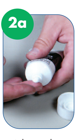
✓ Lubricate the ring seal in the socket.