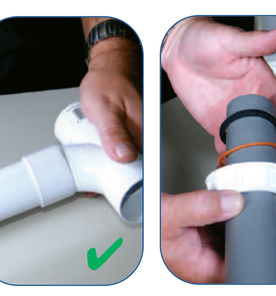
The two systems can be joined using a universal compression fitting.