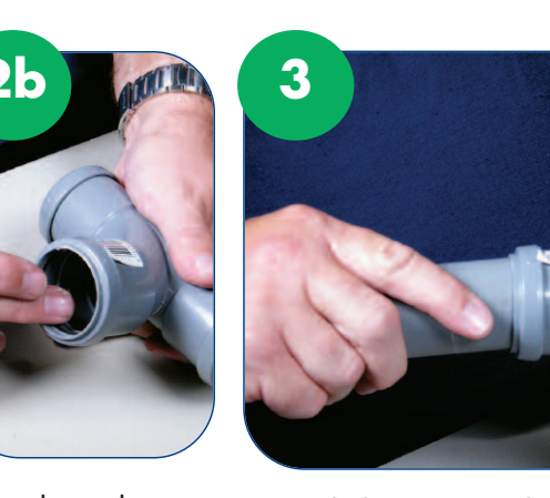
✓ Push the pipe into the socket.