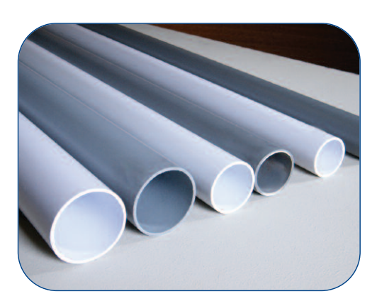
Choose from one of two systems, Push-Fit or Solvent Weld.